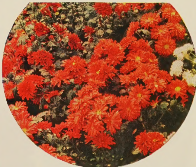
ROUGE CUSHION. 60c each; 3 for $1.50